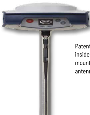
Patented inside-the-rod mounted UHF antenna design

SP80 has a unique combination of communication technologies including an integrated 3.5G GSM/UMTS modem, Bluetooth and Wi-Fi connectivity, and optional internal UHF transmit radio. The cellular modem may be used for SMS (text message) and e-mail alerts as well as regular Internet or VRS connectivity. SMS (text messages) can be used to monitor and configure the receiver. Likewise, SP80 can use all available RTK correction sources and connect to the Internet from the field using WiFi hotspots, where available. The internal UHF transmit/receive radio allows for quick and easy setup as a local base station. This saves time and increases the surveyor's efficiency.